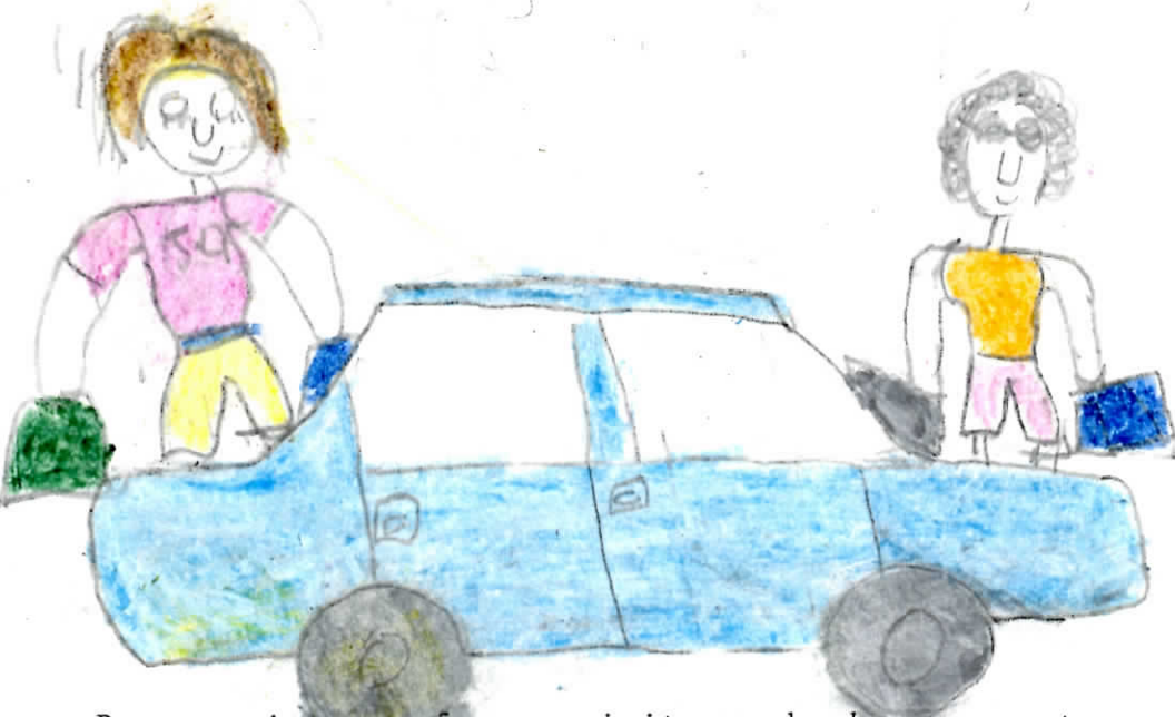
Draw a picture of some visitors who have come to Jamaica from far away.

There tourist just rent a car to go to the hotel.